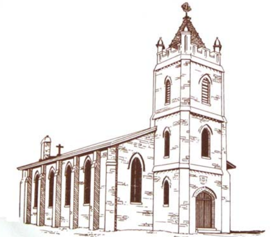
CHRIST CHURCH HER MAJESTY'S CHAPEL ROYAL OF THE MOHAWK