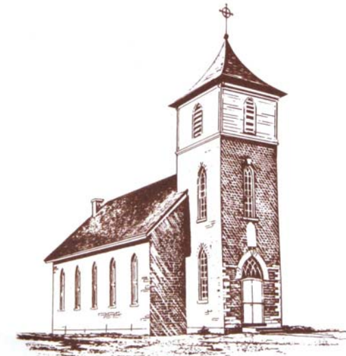
ALL SAINTS' CHURCH TYENDINAGA